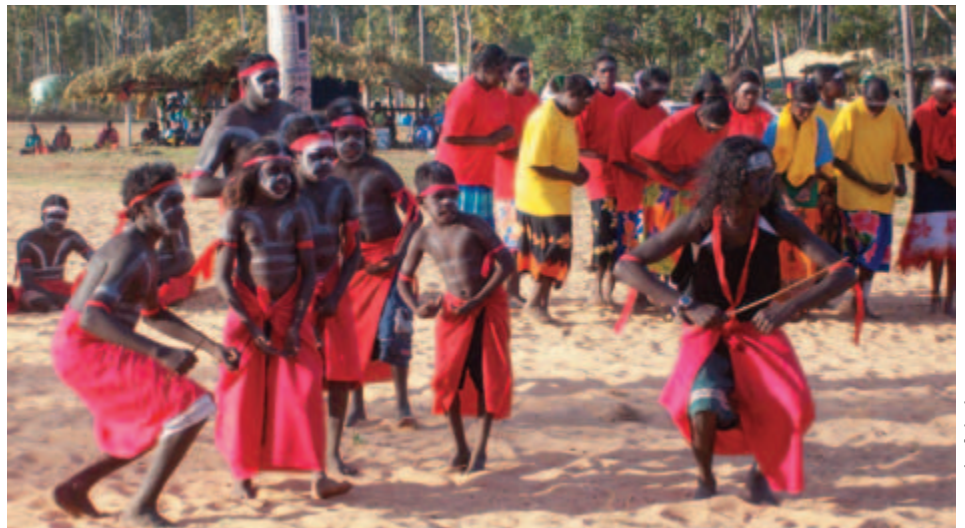
(Above) Groote Eylandt's Warnindilyakwa Dancers at Garma this year.