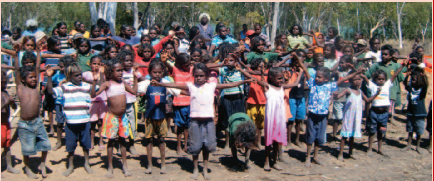
(Above) Young and old celebrated Ngukurr's 100 th Year.